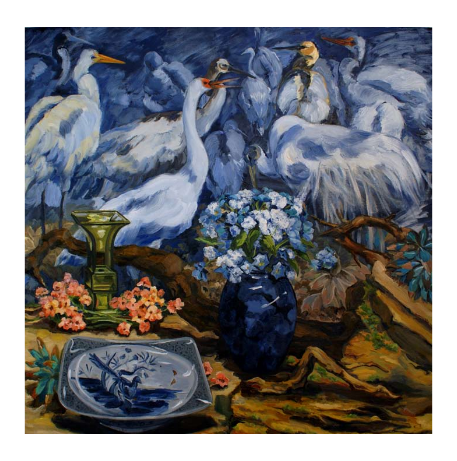
Cranes-Okinawa © 48"x48" Oil/linen 2015