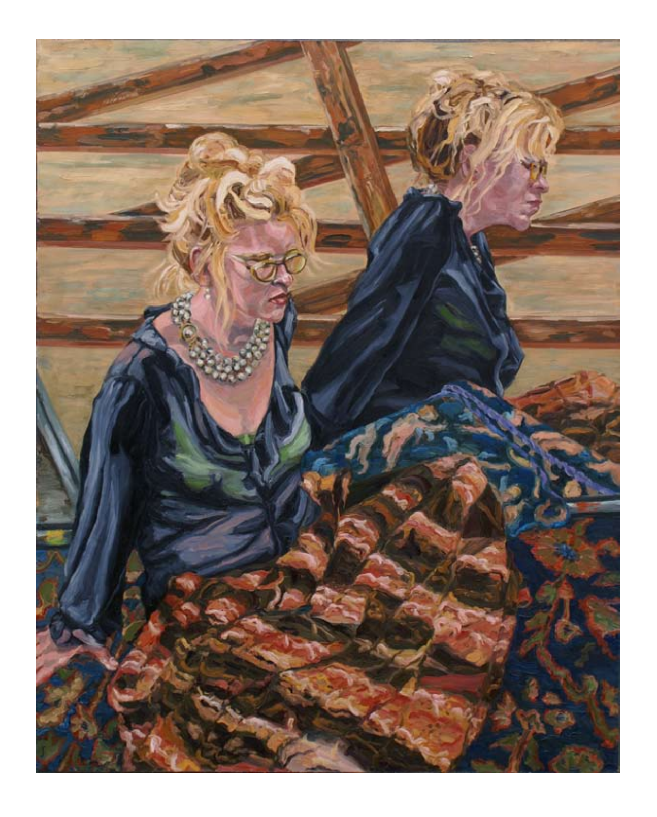
Linea © 65"x65" Oil/linen 1995