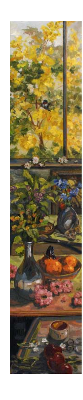
Mahal © 65"x60" Oil/linen 1998