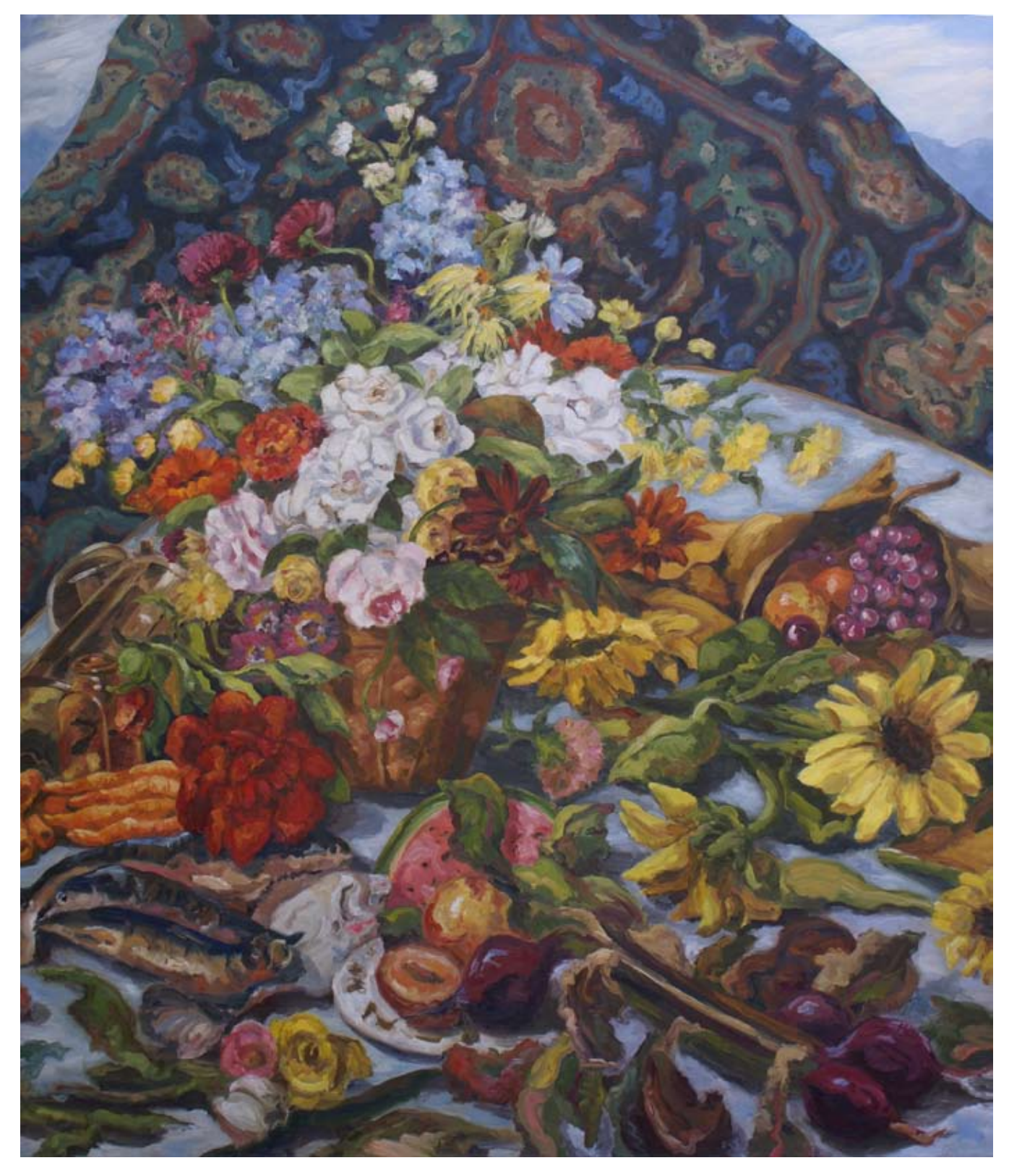
Bouquet © 70"x60" Oil/linen 1998