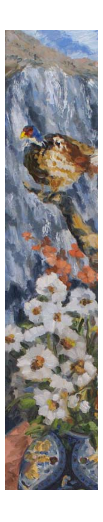
Baluster #13, #14, #16 © 60"x12", 70"x12", 60"x12" Oil/linen 2016, 2016, 2017