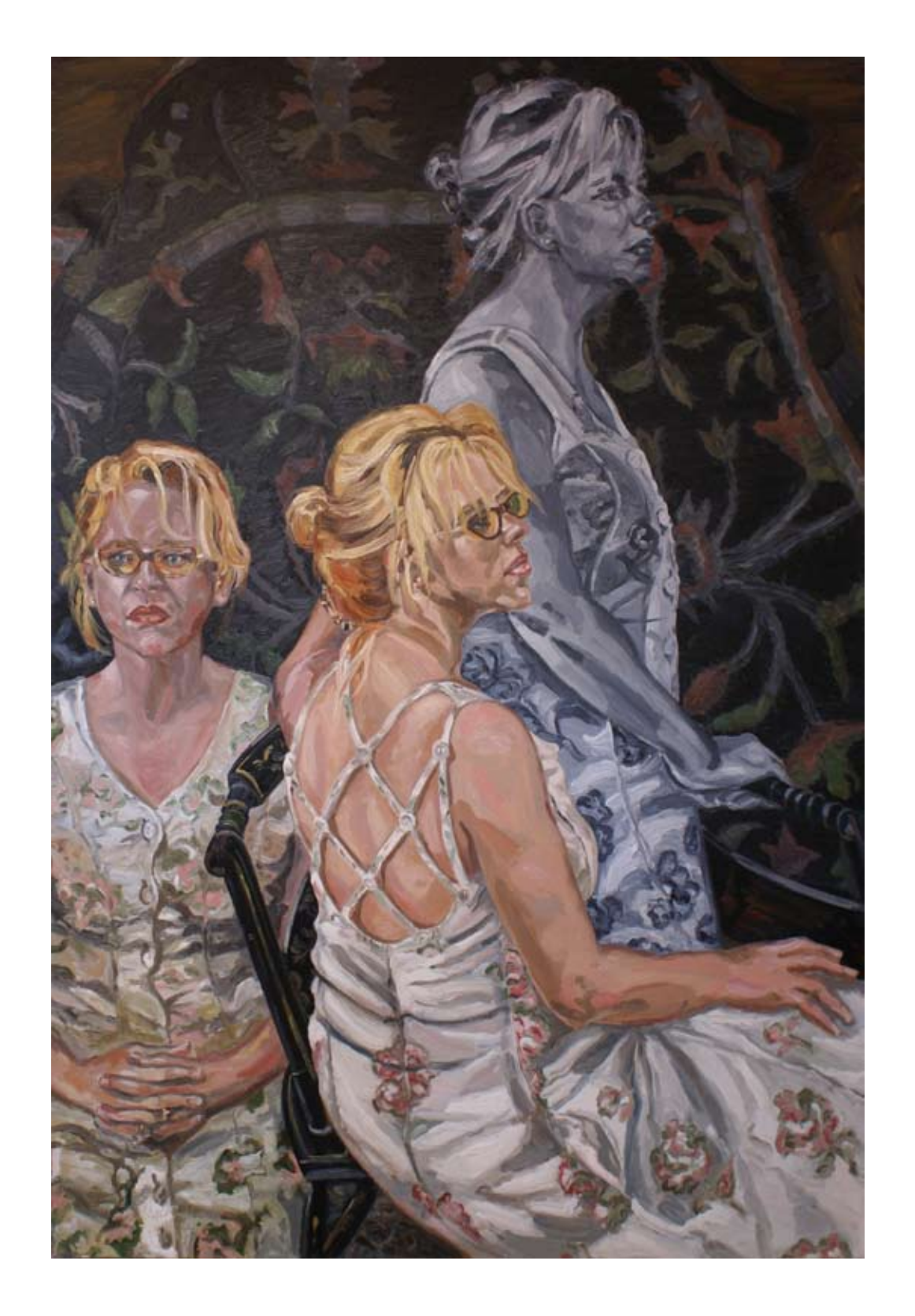
The Floral Dress© 70"x48" Oil/linen 2001