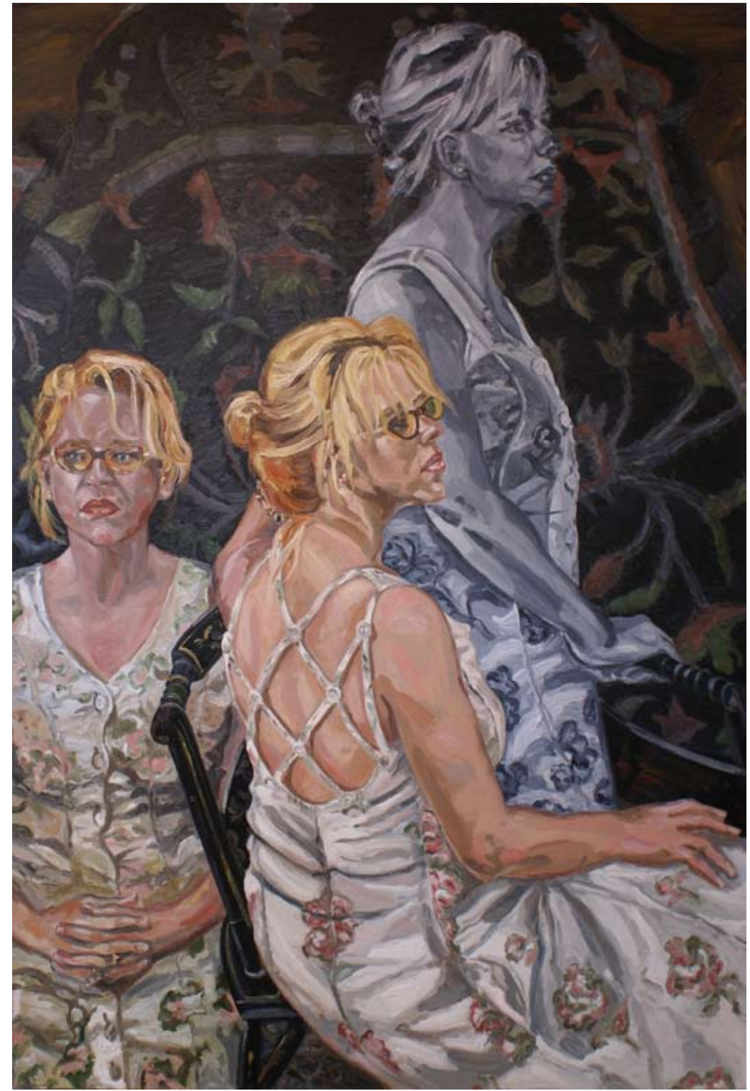
The Floral Dress © 70"x48" Oil/linen 2001