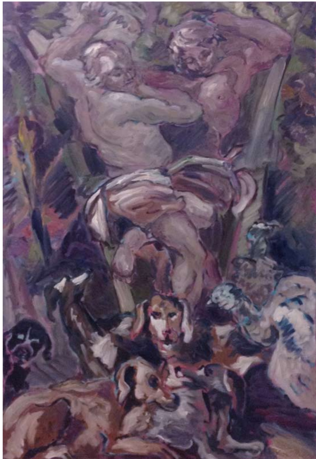
Bestiary-Forest © 60"x40" Oil/linen 1995