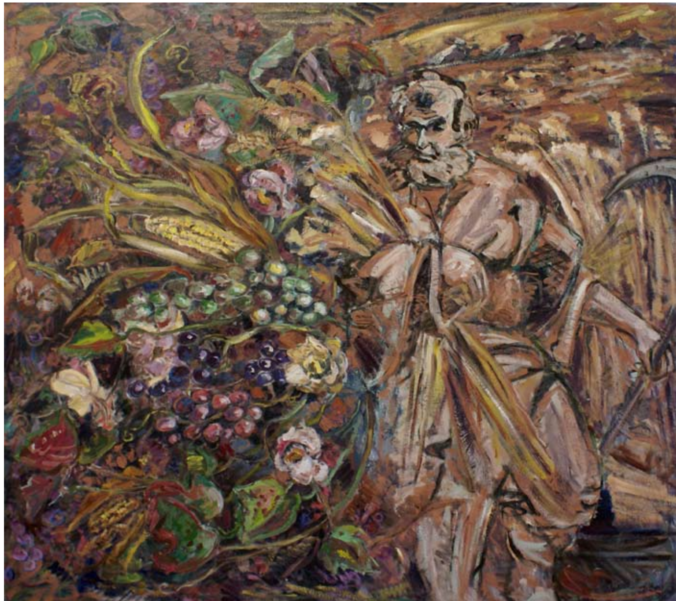
Villa Bona © 60"x65" Oil/linen 1995