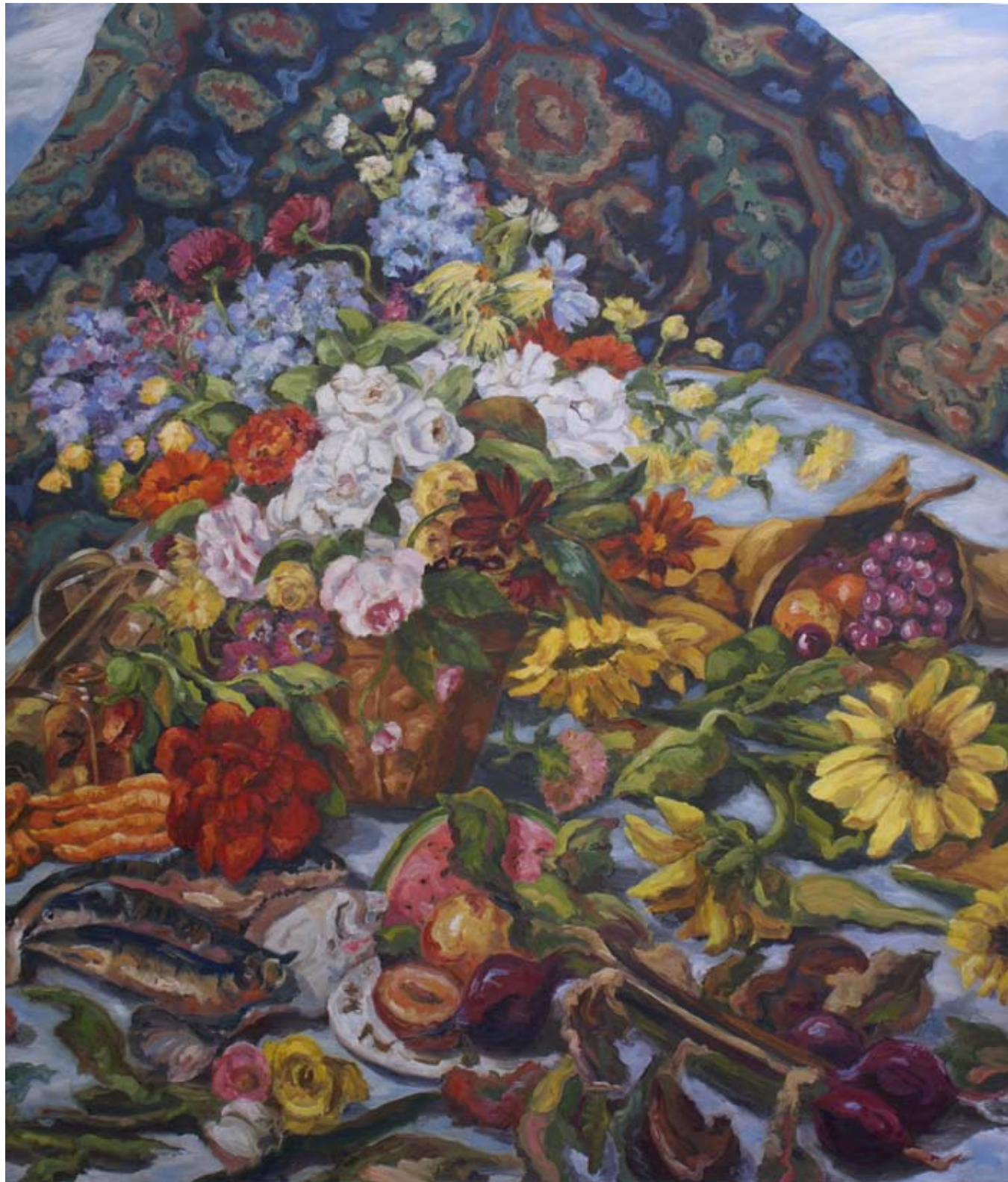
Bouquet © 70"x60" Oil/linen 1998