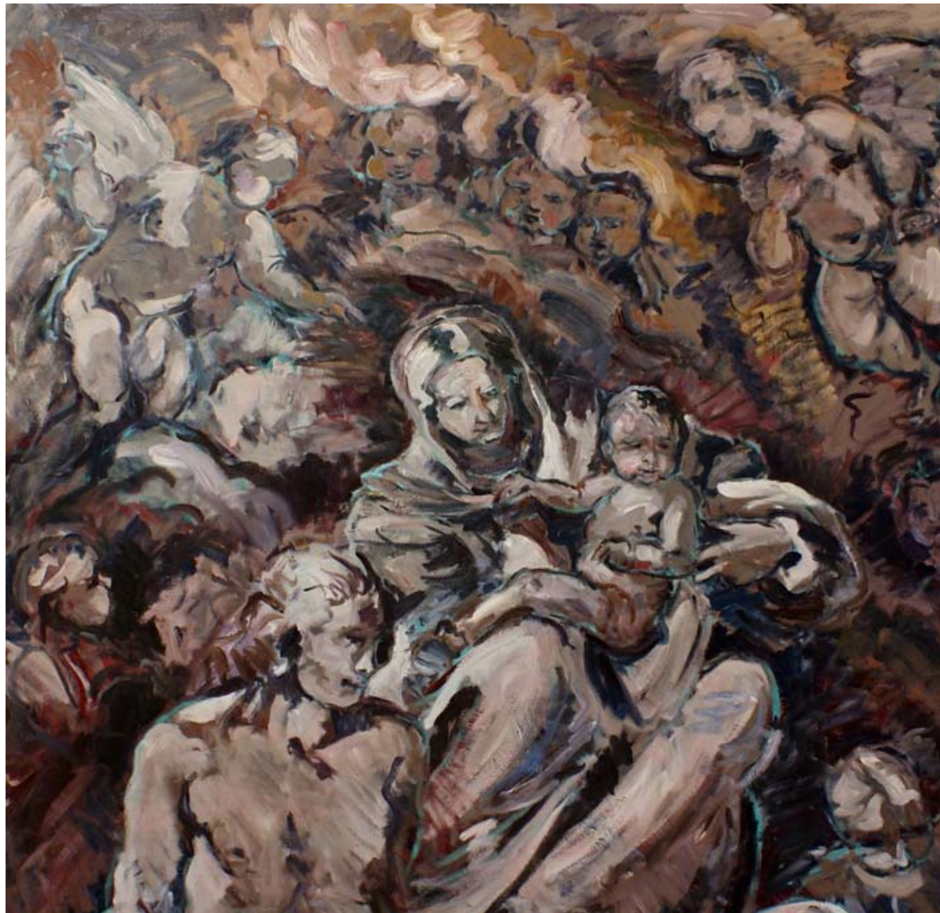
Linea © 65"x65" Oil/linen 1995