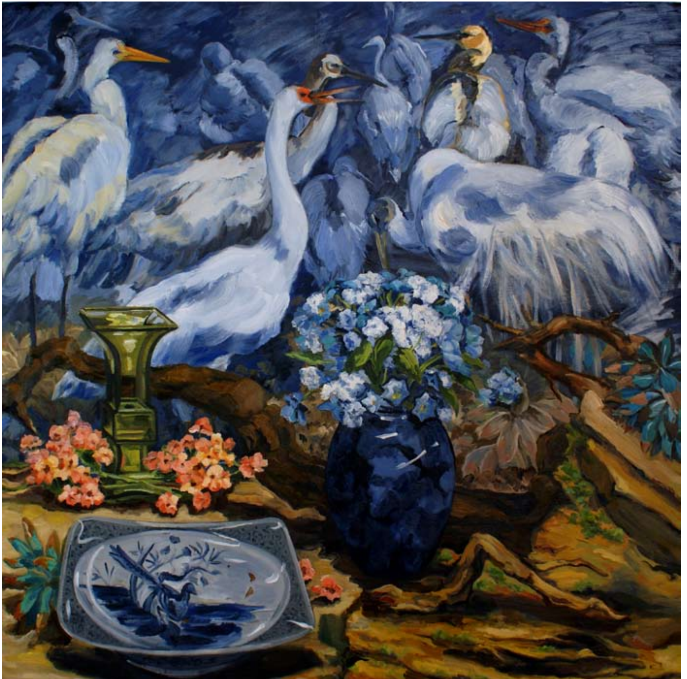
Cranes-Okinawa © 48"x48" Oil/linen 2015