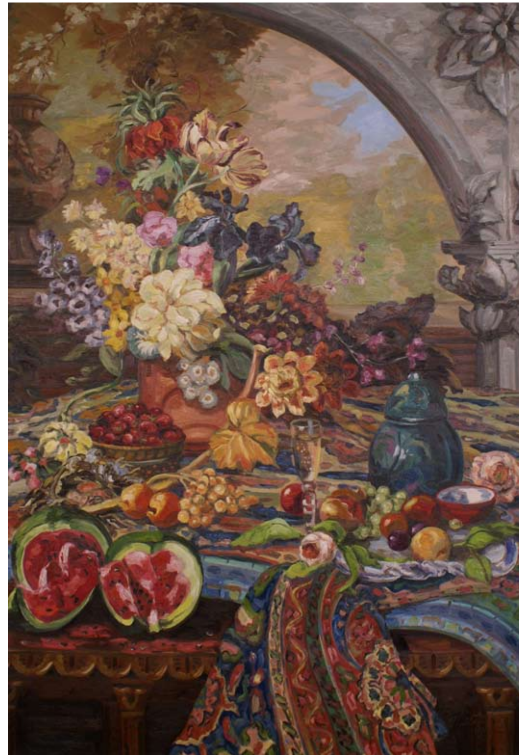
Baluster #7, #8, #9 © 72"x12", 72"x12", 70"x12" Oil/linen 2016