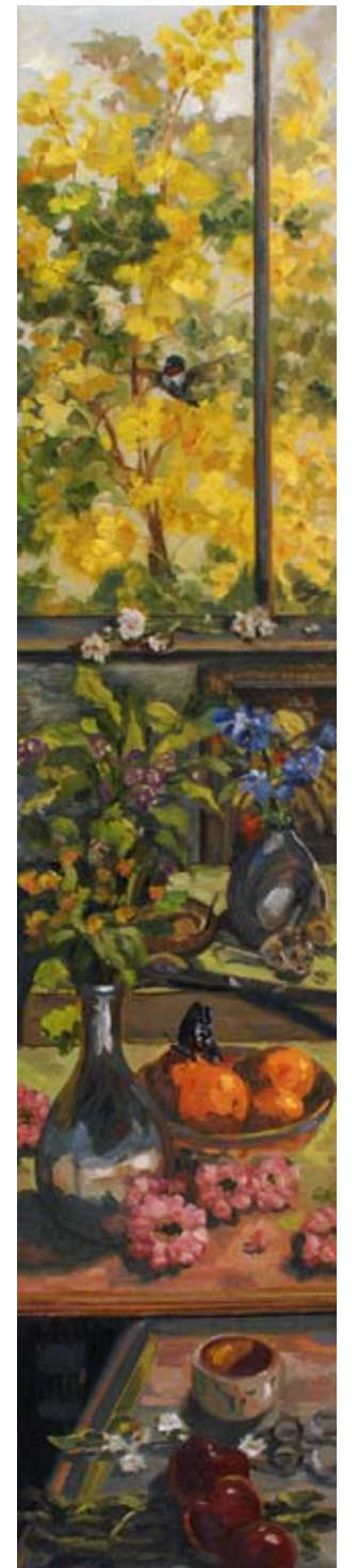
Baluster #10, #11, #12 © 70"x12", 60"x12", 60"x12" Oil/linen 2016