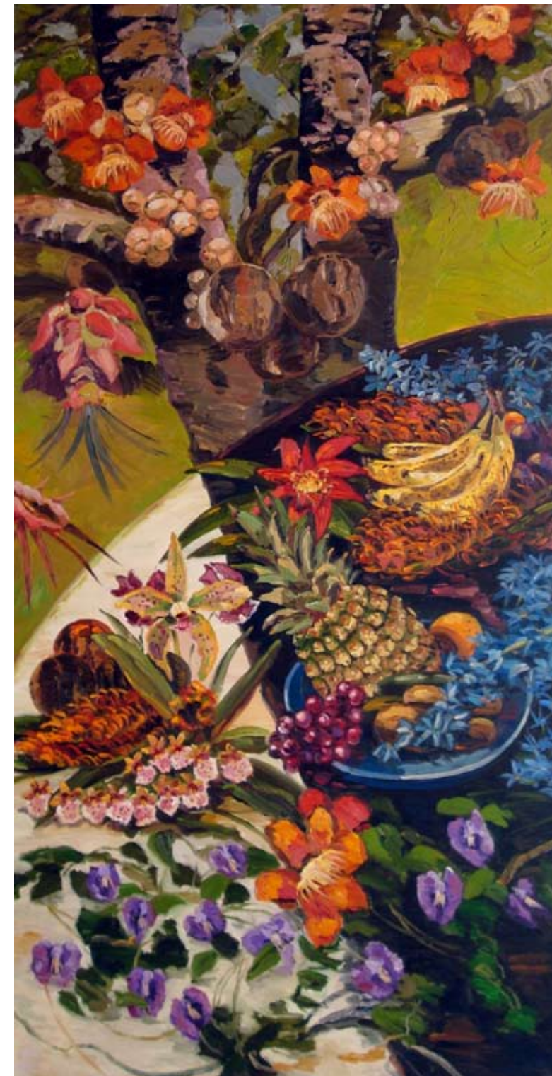
Carmen © 76"x38" Oil/linen 2003