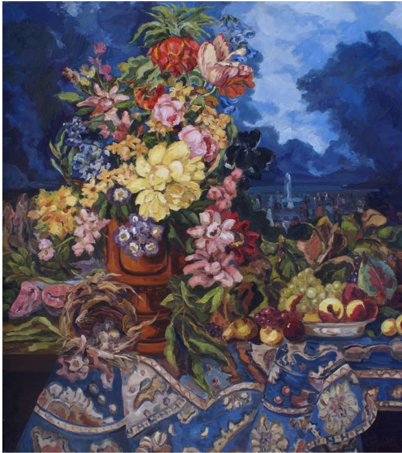
Mahal © 65"x60" Oil/linen 1998