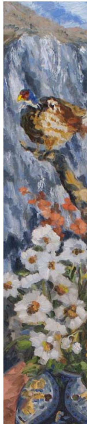
Baluster #13, #14, #16 © 60"x12", 70"x12", 60"x12" Oil/linen 2016, 2016, 2017